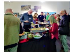
2015 Holiday Gathering

Planning is well underway for the 2019 Appalachian Adventure – details .